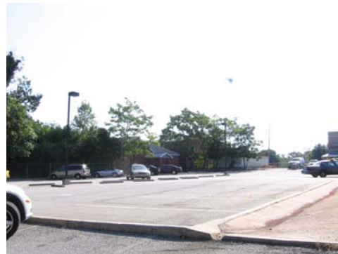
Plenty of Parking