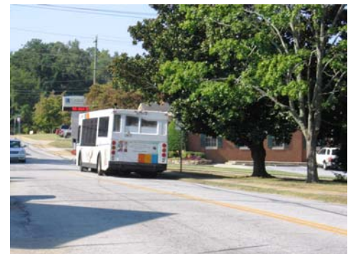
Marta Stop on Corner